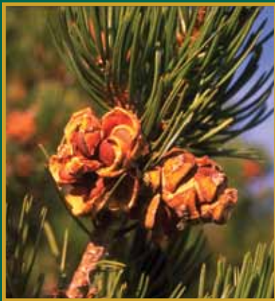
Figure 6: Characteristics of piñon include: