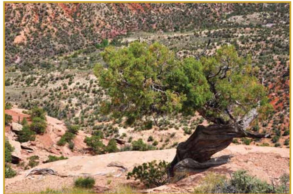
Figure 11: A juniper tree in the Colorado National Monument.

For more information or professional assistance in managing your forest, contact your local Colorado State Forest Service district office.